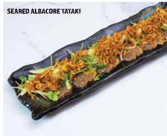
SEARED ALBACORE TATAKI