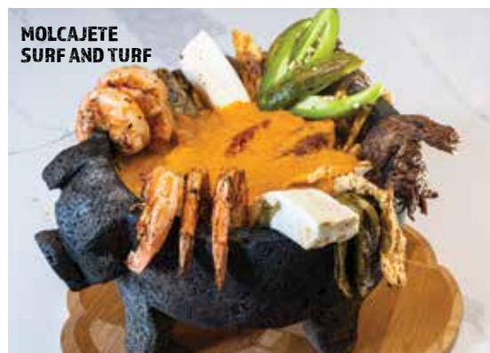
MOLCAJETE SURF AND TURF