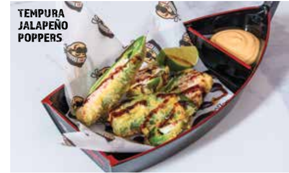
TEMPURA JALAPEÑO POPPERS

POKE TACOS (3 PCS) $12 your choice of ahi tuna, salmon or yellowtail. Topped with yuzu guacamole