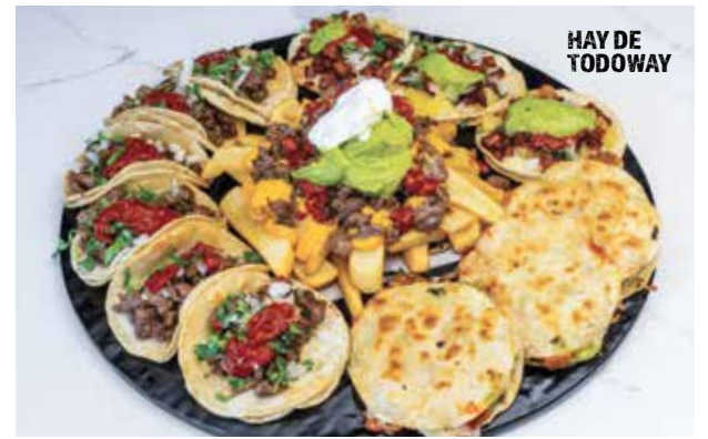
HAY DE TODOWAY