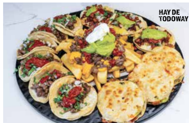
HAY DE TODOWAY