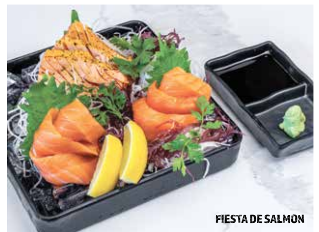
FIESTA DE SALMON